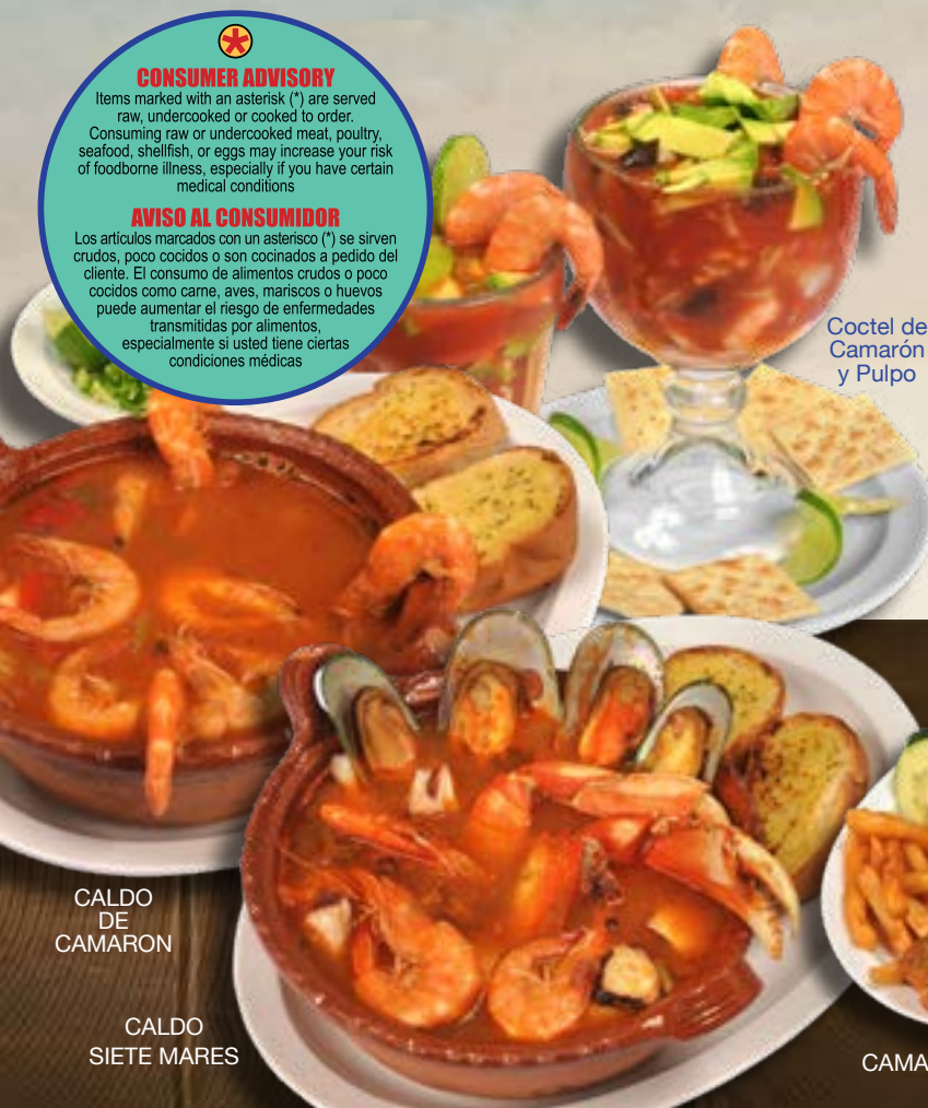
CALDO DE CAMARON

Los artículos marcados con un asterisco (*) se sirven crudos, poco cocidos o son cocinados a pedido del cliente. El consumo de alimentos crudos o poco cocidos como carne, aves, mariscos o huevos puede aumentar el riesgo de enfermedades transmitidas por alimentos, especialmente si usted tiene ciertas condiciones médicas