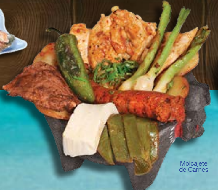
Molcajete de Carnes

Empanadas de Camarón (4) 10 99 Shrimp empanadas